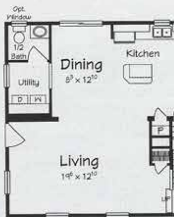
Optional Gable Entry