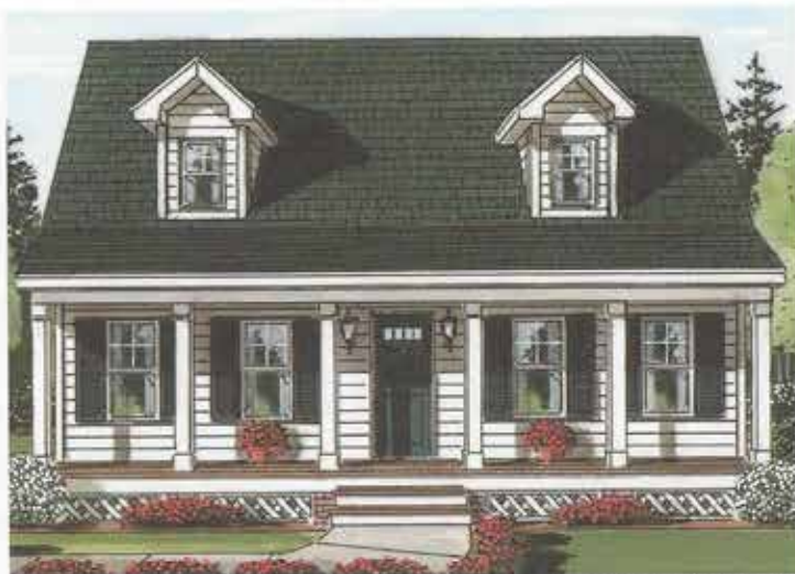
Shown with site built porch and optional split windows