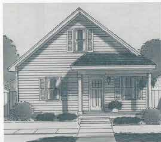
Opt. Gable Entry shown with site built porch

* Please note that the upper-level area is designed for economical completion on-site. Refer to Ritz-Craft's print package and specifications for included materials and discuss all aspects of completion with your selected homebuilder.