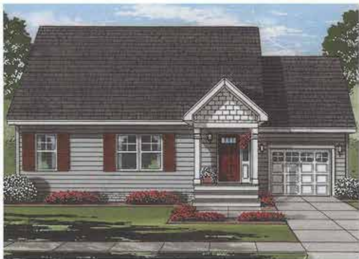
Shown with site built porch and garage