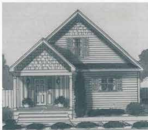
Opt. Gable Entry shown with site built porch

* Please note that the upper-level area is designed for economical completion on-site. Refer to Ritz-Craft's print package and specifications for included materials and discuss all aspects of completion with your selected homebuilder.